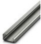
DIN rail, unperforated, G profile, width: 32 mm, height: 15 mm, acc. to EN 60715, material: Steel, galvanized, passivated with a thick layer, length: 2000 mm, color: silver

DIN rail, unperforated - NS 32 UNPERF 2000MM - 1201015