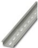
DIN rail perforated, Standard profile, width: 35 mm, height: 7.5 mm, acc. to EN 60715, material: Steel, galvanized, passivated with a thick layer, length: 2000 mm, color: silver

DIN rail perforated - NS 35/ 7,5 PERF 2000MM - 0801733