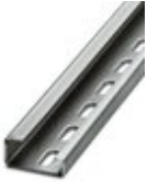
DIN rail perforated, G profile, width: 32 mm, height: 15 mm, acc. to EN 60715, material: Steel, galvanized, passivated with a thick layer, length: 2000 mm, color: silver

DIN rail perforated - NS 32 PERF 2000MM - 1201002