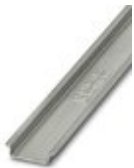
DIN rail, unperforated, Standard profile, width: 35 mm, height: 7.5 mm, acc. to EN 60715, material: Steel, galvanized, passivated with a thick layer, length: 2000 mm, color: silver

DIN rail, unperforated - NS 35/ 7,5 UNPERF 2000MM - 0801681